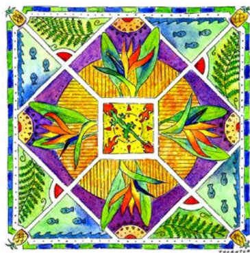
Hawaiian Mandala – Bird of Paradise

She started as a typesetter in commercial printing, then office support for WJLA-TV in Washington, DC, and the Los Angeles Times bureau there. A 26-year stopover in the SF Bay Area followed, where she returned to type and design, running a successful graphic design business that served Silicon Valley corporations and local government. After closing her design firm, it was a stint as Associate Art Director for Stanford magazine where she found her true calling: illustration. And once that illustration bug hit, there was no looking back. Today, you can find the playful style of her illustrations reflected in her fine art.